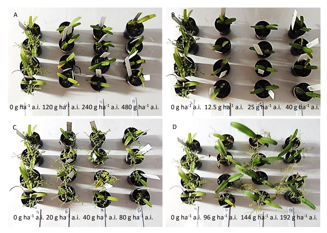
Figure 1. Aspects of seedlings of Rhynchostylis ([ Rhynchostylis gigantea Alba x Rhynchostylis gigantea ] X Rhynchostylis gigantea Semi-Alba) and control of P. microphylla at 49 days after application of herbicides (A) oxyfluorfen, (B) flumioxazin, (C) nicosulfuron, and (D) mesotrione.

and 1B respectively), while the other molecules have not provided this effect. Both herbicides (oxyfluorfen and flumioxazin) molecules are absorbed by leaves and the roots, and have great persistence in soil, increasing and prolonging its effect (Jursík et al., 2011; Jung, 2011), justifying the results observed in this test.